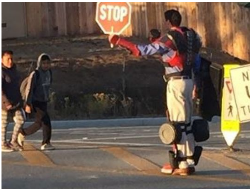
A traffic safety advocate dressed as an action figure hero escorts two girls across the street near a Seaside Middle School on Wednesday.

Pedestrian safety month: A human action figure dressed in car parts escorted Seaside Middle school students across the street on Wednesday as part of the state educational campaign, "Pedestrians Don't Have Armor." The California State Senate has declared September "California Pedestrian Safety Month." In 2015 alone, pedestrians were 25 percent of all roadway deaths in California, up from 17 percent 10 years earlier, according to Office of Traffic Safety.