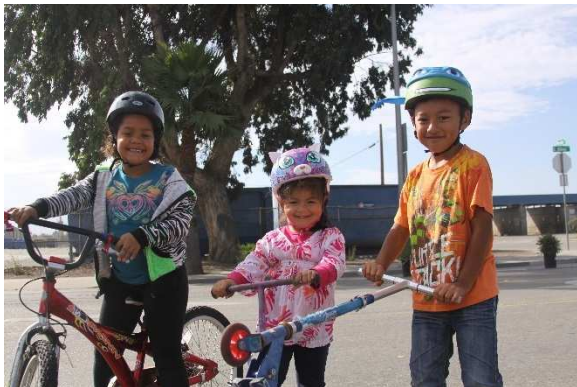
Children at the 2015 Ciclovía Salinas

Vision: Active transportation will be an integral, convenient and safe part of daily life in Monterey County for residents and visitors of all ages and abilities.