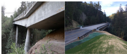
Highway 1 Pfeiffer Canyon Bridge (before/after)