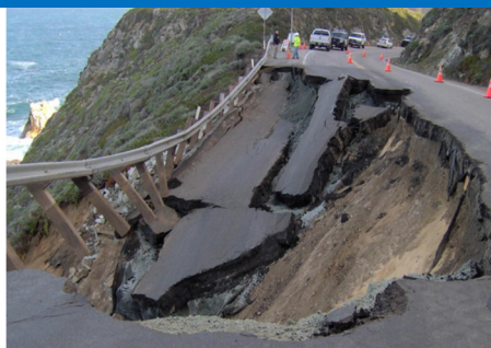
Highway 1 near Carmel in Monterey County

Adaptation efforts enhance the transportation system's resiliency to help protect against climate impacts. Eligible projects include roads, railways, bikeways, trails, bridges, ports and airports. The sustainable grant program supports climate change adaptation on the transportation system, especially in communities most vulnerable to impacts. More information: http://www.dot.ca.gov/hq/tpp/grants.html