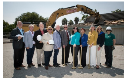
Local partners celebrate rail extension