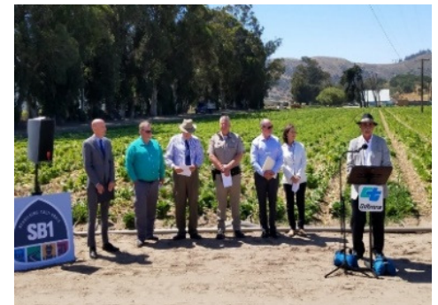
Caltrans and partners celebrate project's completion Highway 246 Passing Lanes Completed

Statewide, Caltrans is committed to fixing more than 17,000 lane miles of pavement, 500 bridges, 55,000 culverts, and 7,700 traffic operating systems. More information: http://rebuildingca.gov/