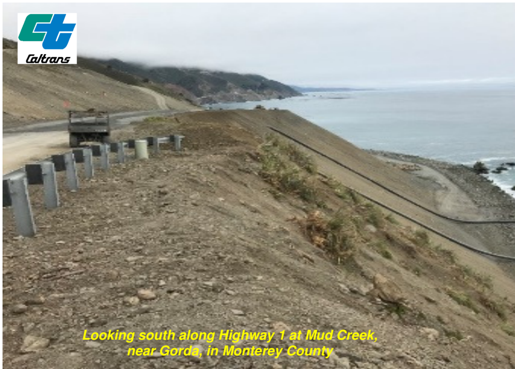
Looking south along Highway 1 at Mud Creek, near Gorda, in Monterey County