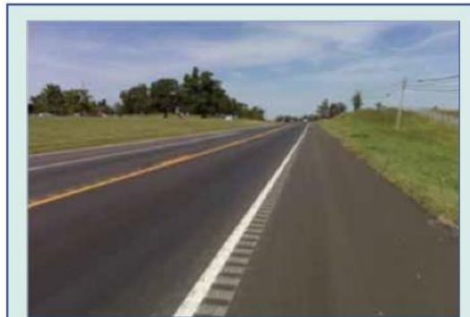
EDGE-LINE RUMBLE STRIP