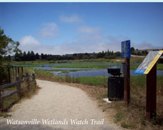
Watsonville Wetlands Watch Trail