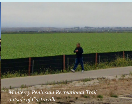
Monterey Peninsula Recreational Trail outside of Castroville