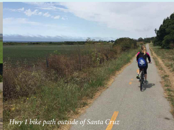
Hwy 1 bike path outside of Santa Cruz