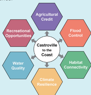
Multi-benefits of the Castroville to the Coast Project

Over the past few years, many community stakeholders have met to discuss surface water, open-space, and flood control needs and through that dialogue the “Castroville to the Coast” concept arose. The goal of Castroville to the Coast is to restore degraded waterways, improve water quality, reduce flooding, and provide a pedestrian and bike path between Castroville and the Coast. New state funding opportunities makes this project a great opportunity to invest in Castroville as an agricultural community in harmony with a well-managed system of creeks and wetlands.