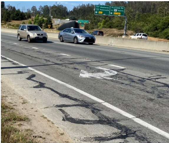
Figure 1: US 101 Northbound seen from Vierra Canyon Road.

The US 101 Prunedale Capital Preventative Maintenance Project is located on Route US 101 through Prunedale in Monterey county. The purpose of this maintenance project is to extend the service life and improve the ride quality of the existing pavement and reduce future maintenance expenditures. Other proposed improvements include upgrade of guardrails, median barrier, roadside signs, Intelligent Transportation Systems elements, and replacement or rehabilitation of drainage systems. The project limit breaks between postmile 98.8 and 100.3.