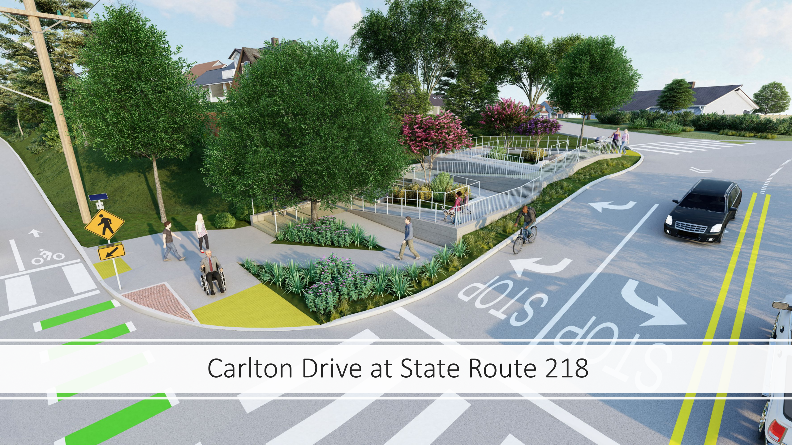
Carlton Drive at State Route 218