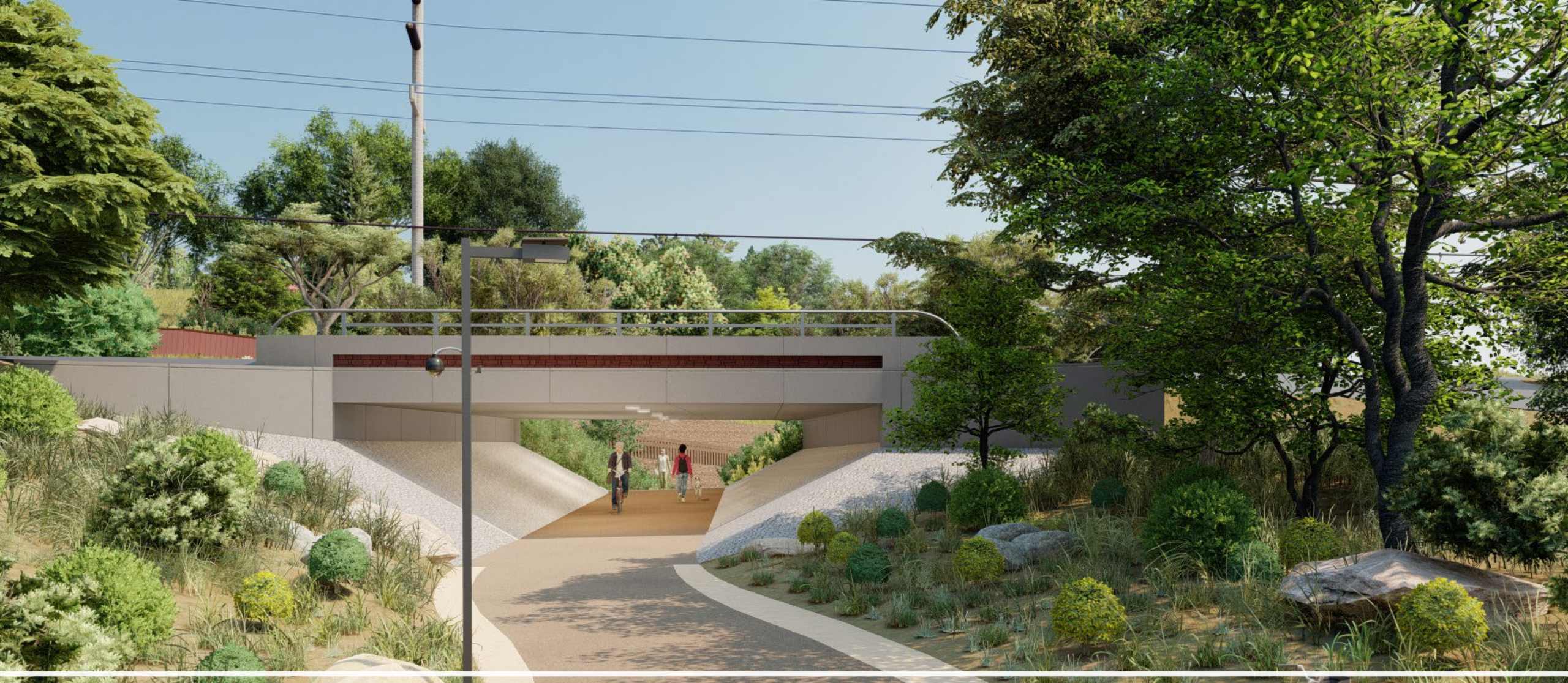
Undercrossing at State Route 218