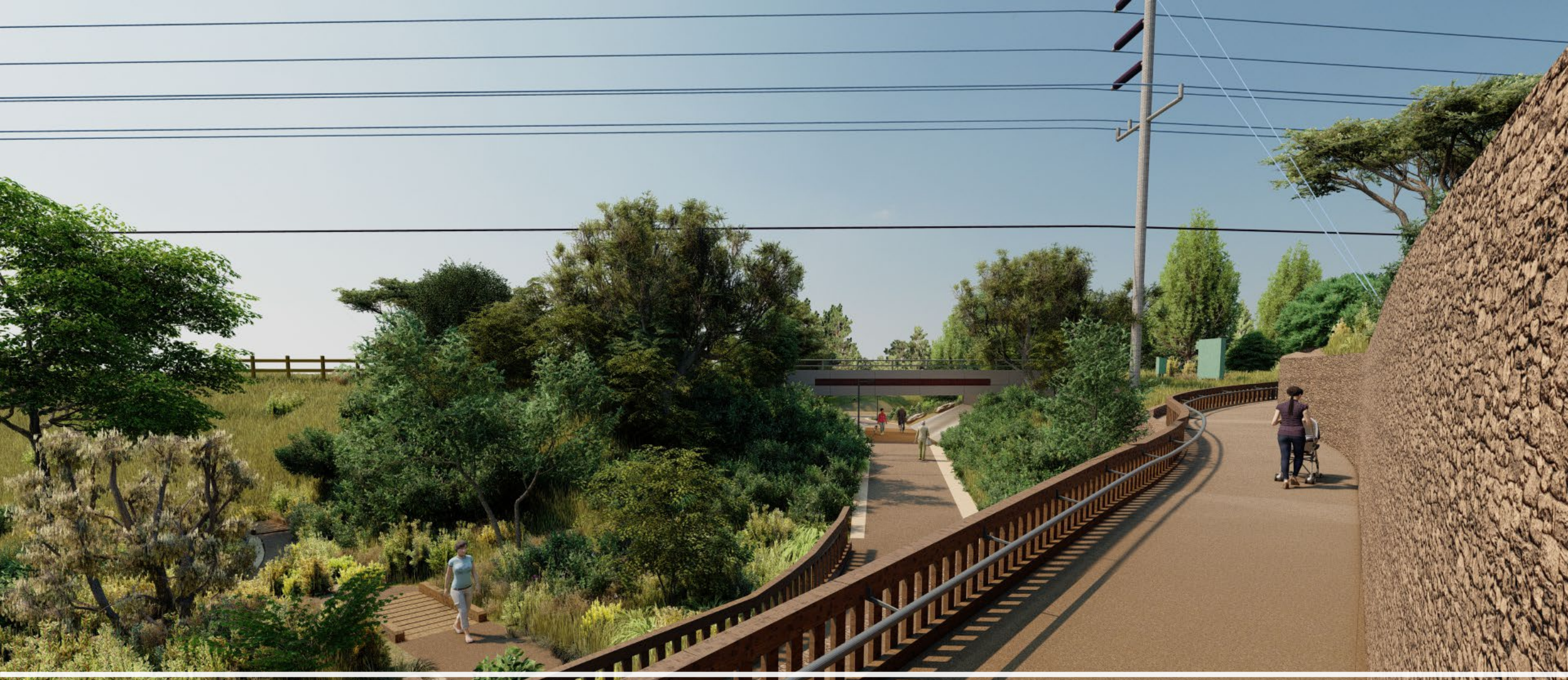
View from the Frog Pond Reserve