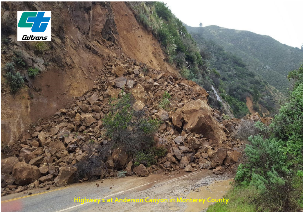
Highway 1 at Anderson Canyon in Monterey County