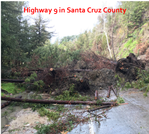
Highway 9 in Santa Cruz County

A quarterly publication for our transportation partners